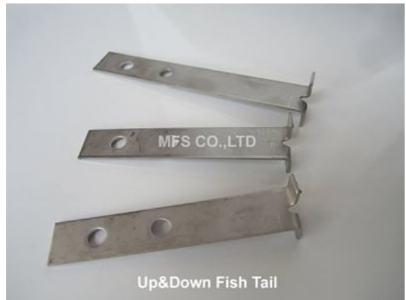
Up&Down Fish Tail