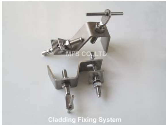
Cladding Fixing System