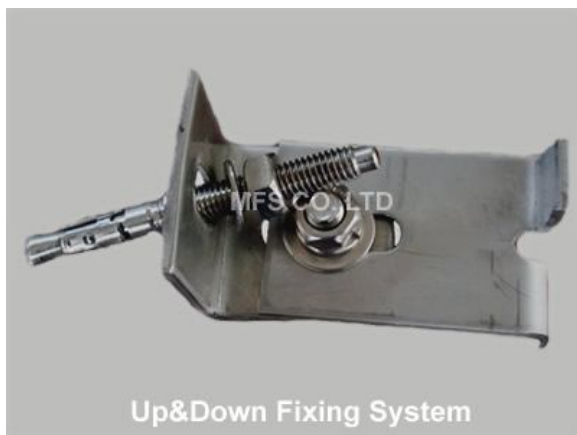
Up&Down Fixing System