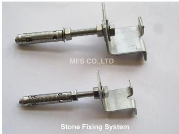
Stone Fixing System