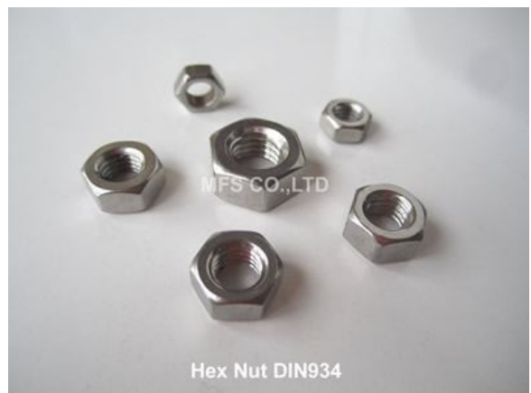
Hex Nut DIN934