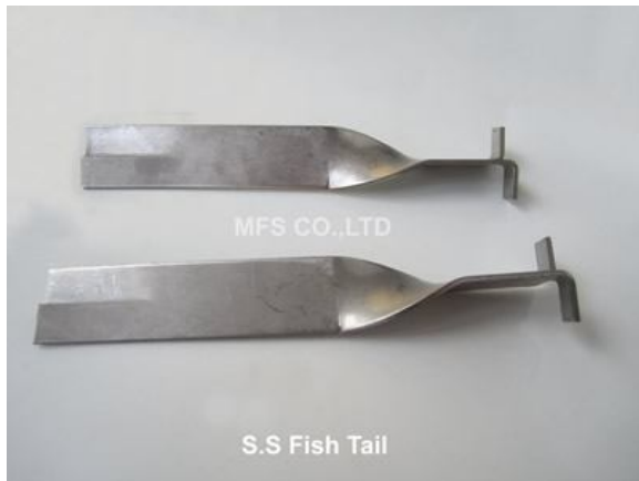
S.S Fish Tail