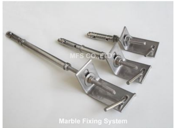
Marble Fixing System