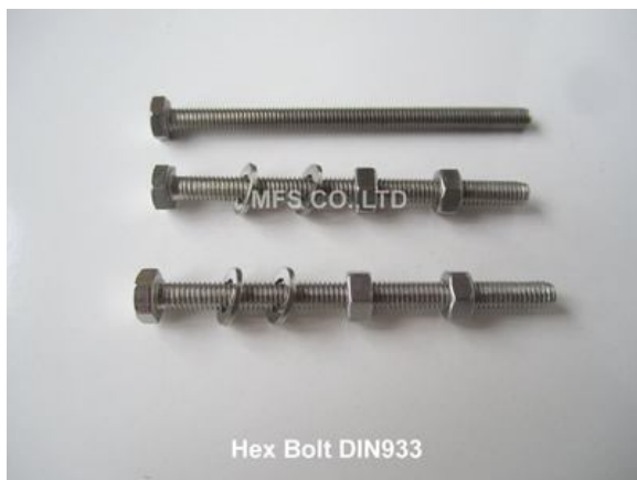
Hex Bolt DIN933