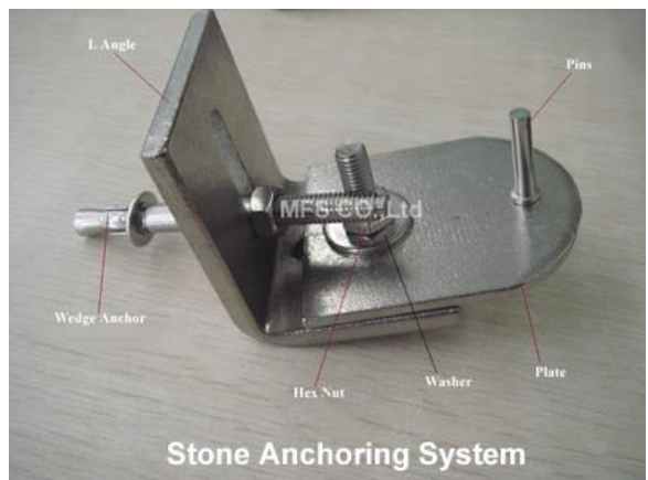
Stone Anchoring System